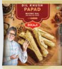
DIL KHUSH PAPAD