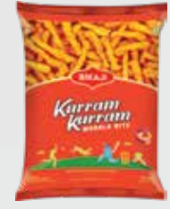
KURRAM KURRAM MASALA BITE