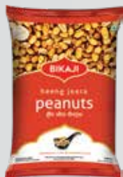
HEENG JEERA PEANUTS