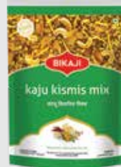
KAJU KISMIS MIX