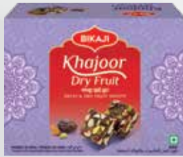
KHAJOUR DRY FRUIT BARFI