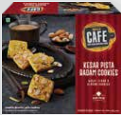
KESAR PISTA BADAM COOKIES