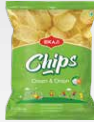
CREAM & ONION