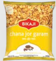
CHANA JOR GARAM