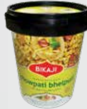
CHOWPATI BHELपुरI (MOBILE BHELपुरI CAN)