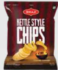
KETTLE STYLE CHIPS SIZZLING BARBEQUE