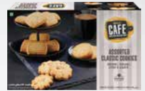
ASSORTED CLASSIC COOKIES