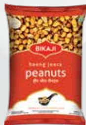
HEENG JEERA PEANUTS