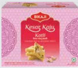
KESAR KAJU KATLI