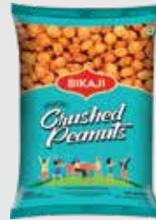
ROASTED CRUSHED PEANUTS