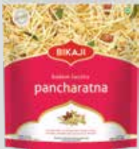
BADAM LACCHA PANCHARATNA