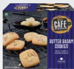
BUTTER BADAM COOKIES