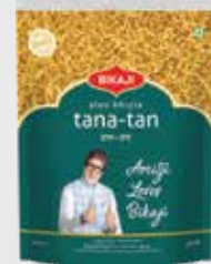
TANA-TAN ALOO BHUJIA