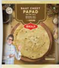
BAAT CHEET PAPAD