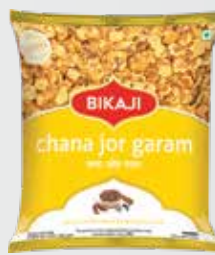
CHANA JOR GARAM