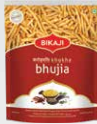
KROREPATI KHOKHA BHUJIA