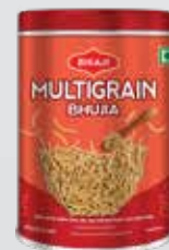
MULTIGRAIN BHUJIA TIN