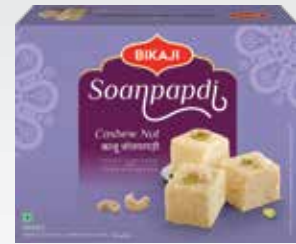
SOANPAPDI (CASHEW NUT)