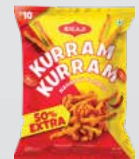
KURRAM KURRAM NAUGHTY TOMATO