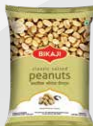
CLASSIC SALTED PEANUTS