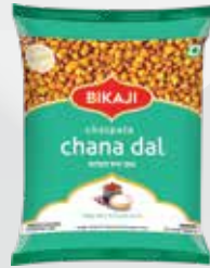
CHATPATA CHANA DAL