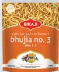
SPECIAL SOFT BIKANERI BHUJIA NO. 3