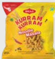
KURRAM KURRAM NOODLE MASALA