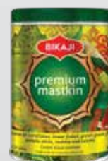
PREMIUM MASTKIN TIN