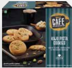
KAJU PISTA COOKIES