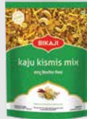
KAJU KISMIS MIX