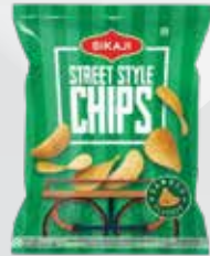
STREET STYLE CHIPS SAMOSA