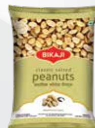
CLASSIC SALTED PEANUTS