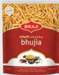
KROREPATI KHOKHA BHUJIA