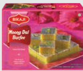
MOONG DAL BURFEE