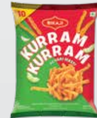
KURRAM KURRAM AACHARI MASTI