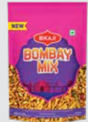
NEW BOMBAY MIX