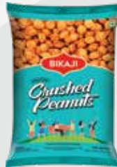
ROASTED CRUSHED PEANUTS