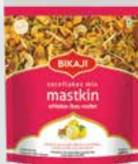
MASTKIN CORNFLAKES MIX