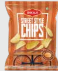
STREET STYLE CHIPS DAL KACHORI