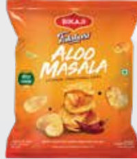
FALAHARI ALOO MASALA CHIPS