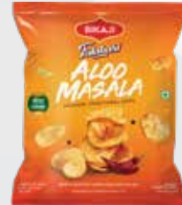
FALAHARI ALOO MASALA CHIPS