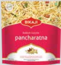
BADAM LACCHA PANCHARATNA