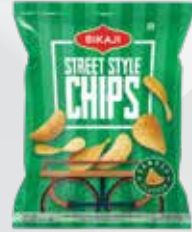
STREET STYLE CHIPS SAMOSA