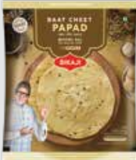
BAAT CHEET PAPAD