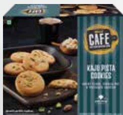
KAJU PISTA COOKIES