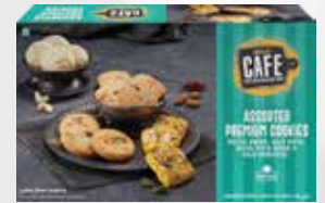
ASSORTED PREMIUM COOKIES