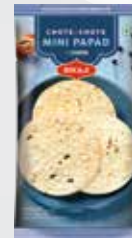
CHOTE - CHOTE MINI PAPAD