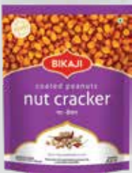
NUT CRACKER COATED PEANUTS