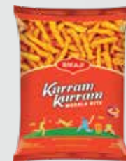
KURRAM KURRAM MASALA BITE