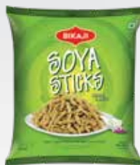
SOYA STICKS CREAM & ONION