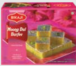
MOONG DAL BURFEE