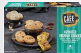
ASSORTED PREMIUM COOKIES