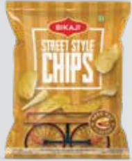
STREET STYLE CHIPS VADA PAV