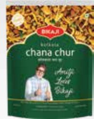
KOLKATA CHANA CHUR