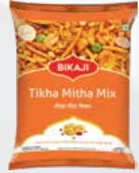
TIKHA MITHA MIX