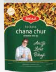
KOLKATA CHANA CHUR