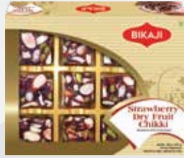
STRAWBERRY DRY FRUIT CHIKKI