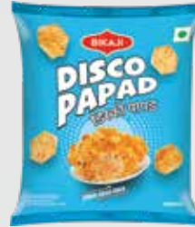
READY-TO-EAT DISCO PAPAD