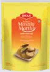
ACHARI MASALA MATTHI