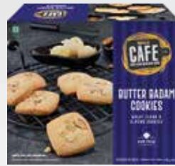
BUTTER BADAM COOKIES