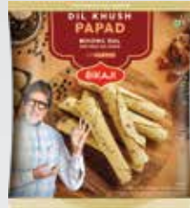
DIL KHUSH PAPAD