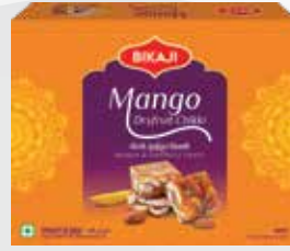
MANGO DRY FRUIT CHIKKI