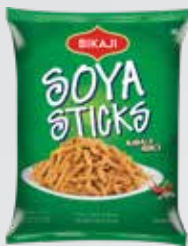
SOYA STICKS MASALA MUNCH