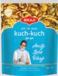
KUCH-KUCH ALL IN ONE