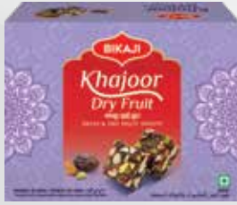
KHAJOUR DRY FRUIT BARFI