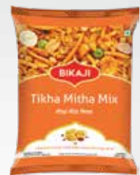
TIKHA MITHA MIX