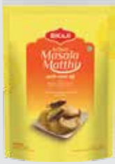
ACHARI MASALA MATTHI