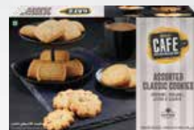
ASSORTED CLASSIC COOKIES