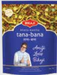
TANA-BANA KHATTA MEETHA