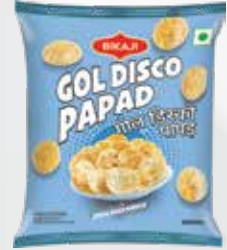
READY-TO-EAT GOL DISCO PAPAD