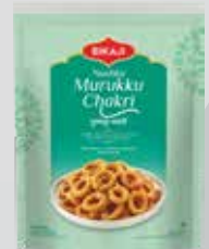
NASTA MURUKKU CHAKRI