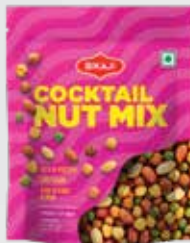
COCKTAIL NUT MIX