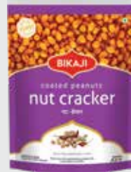
NUT CRACKER COATED PEANUTS