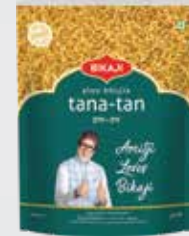
TANA-TAN ALOO BHUJIA