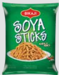
SOYA STICKS MASALA MUNCH