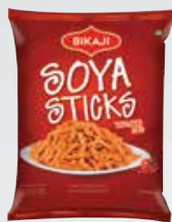
SOYA STICKS TOMATO BITE