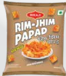
READY-TO-EAT RIM-JHIM PAPAD