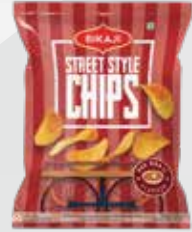
STREET STYLE CHIPS PAV BHAJI