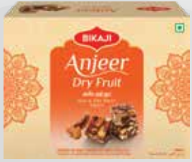
ANJEER DRY FRUIT BARFI