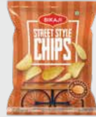
STREET STYLE CHIPS DAL KACHORI