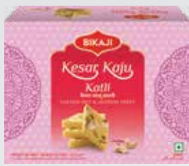
KESAR KAJU KATLI