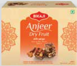
ANJEER DRY FRUIT BARFI