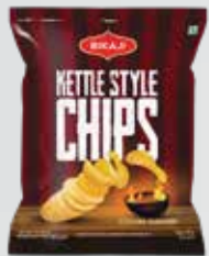
KETTLE STYLE CHIPS SIZZLING BARBEQUE