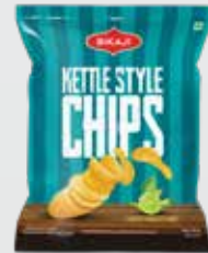
KETTLE STYLE CHIPS SWEET CHILLI LIME