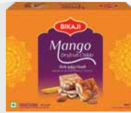
MANGO DRY FRUIT CHIKKI