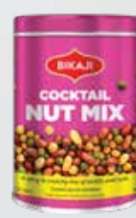
COCKTAIL NUT MIX TIN