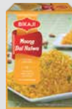
MOONG DAL HALWA