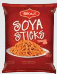
SOYA STICKS TOMATO BITE