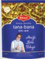
TANA-BANA KHATTA MEETHA