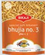
SPECIAL SOFT BIKANERI BHUJIA NO. 3