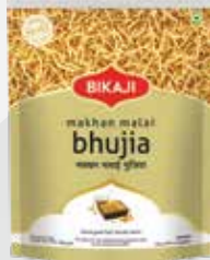
MAKHAN MALAI BHUJIA