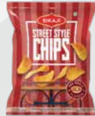
STREET STYLE CHIPS PAV BHAJI