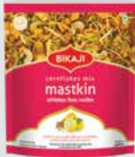
MASTKIN CORNFLAKES MIX