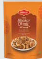
MINI BHAKAR WADI