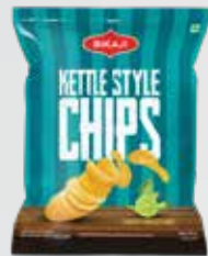
KETTLE STYLE CHIPS SWEET CHILLI LIME