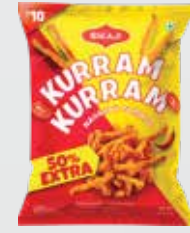
KURRAM KURRAM NAUGHTY TOMATO