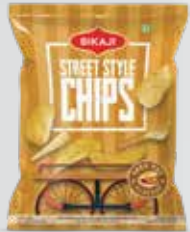
STREET STYLE CHIPS VADA PAV