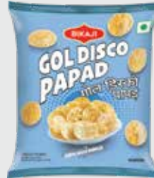
GOL DISCO PAPAD