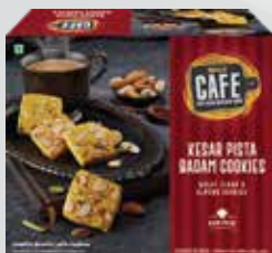
KESAR PISTA BADAM COOKIES