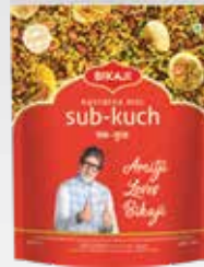
SUB-KUCH NAVRATAN MIX