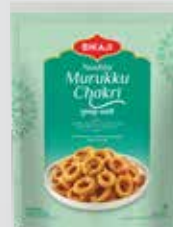
NASTA MURUKKU CHAKRI