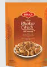
MINI BHAKAR WADI