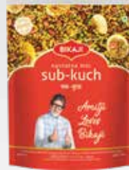
SUB-KUCH NAVRATAN MIX