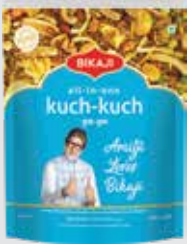
KUCH-KUCH ALL IN ONE