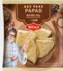
AAS PAAS PAPAD