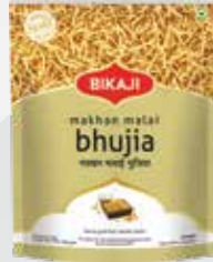
MAKHAN MALAI BHUJIA