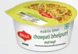
CHOWPATI BHELपुरI (MOBILE BHELपुरI BOWL)