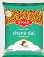
CHATPATA CHANA DAL