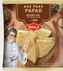
AAS PAAS PAPAD