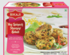
VEG SPINACH SHAMMI KEBAB