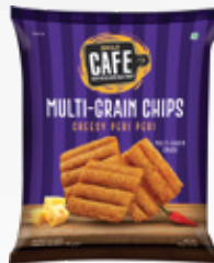
MULTI-GRAIN CHIPS CHEESY PERI PERI