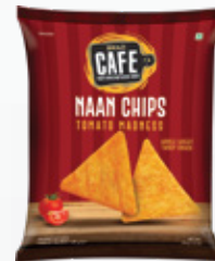
NAAN CHIPS TOMATO MADNESS