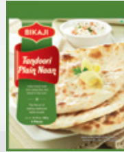
TANDOORI PLAIN NAAN