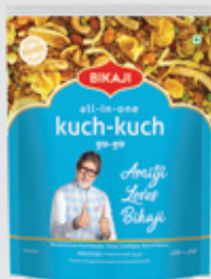
KUCH-KUCH ALL IN ONE