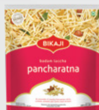
BADAM LACCHA PANCHARATNA