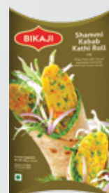
SHAMMI KEBAB KATHI ROLL