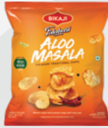
FALAHARI ALOO MASALA CHIPS