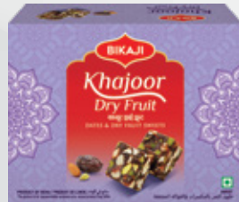
KHAJOOR DRY FRUIT BARFI