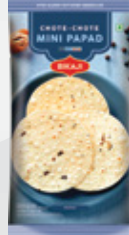
CHOTE - CHOTE MINI PAPAD