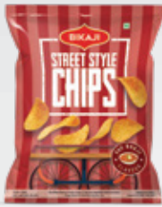
STREET STYLE CHIPS PAV BHAJI