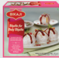
BHALLA FOR DAHI BHALLA