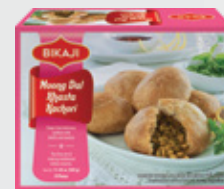
MOONG DAL KHASTA KACHORI