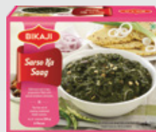
SARSO KA SAAG