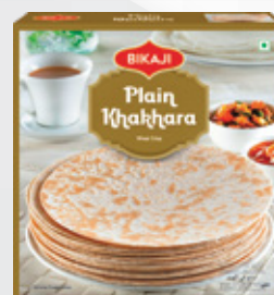
PLAIN KHA KHARA