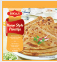
HOME STYLE PARATHA