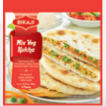
MIX VEG KULCHA