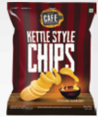
KETTLE STYLE CHIPS SIZZLING BARBEQUE