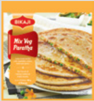
MIX VEG PARATHA