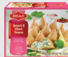
SPINACH & CHEESE SAMOSA