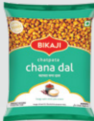
CHATPATA CHANA DAL