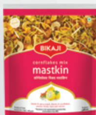
MASTKIN CORNFLAKES MIX