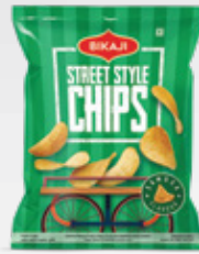
STREET STYLE CHIPS SAMOSA