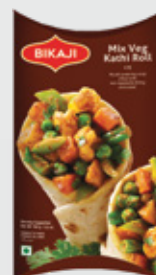
MIX VEG KATHI ROLL