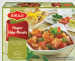
PANEER TIKKA MASALA