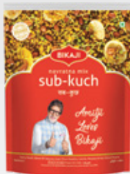
SUB-KUCH NAVRATAN MIX