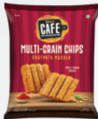
MULTI-GRAIN CHIPS CHATPATA MASALA