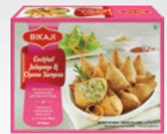
COCKTAIL JALAPENO & CHEESE SAMOSA