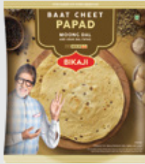
BAAT CHEET PAPAD