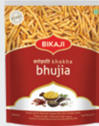
KROREPATI KHOKHA BHUJIA