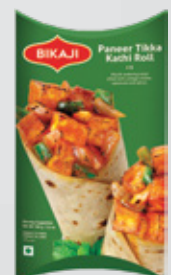
PANEER TIKKA KATHI ROLL