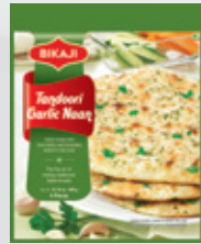
TANDOORI GARLIC NAAN