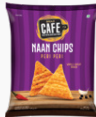
NAAN CHIPS PERI PERI