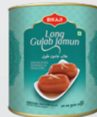
LONG GULAB JAMUN