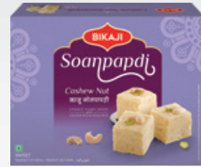
SOANPAPDI (CASHEW NUT)