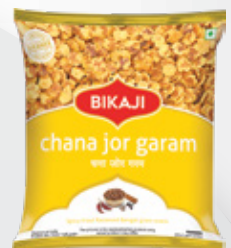
CHANA JOR GARAM