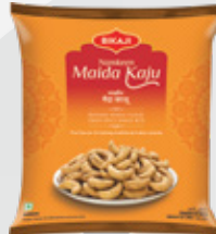
NAMKEEN MAIDA KAJU