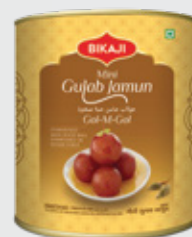
MINI GULAB JAMUN