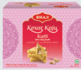
KESAR KAJU KATLI