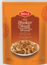
MINI BHAKAR WADI