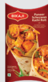
PANEER SCHEZWAN KATHI ROLL