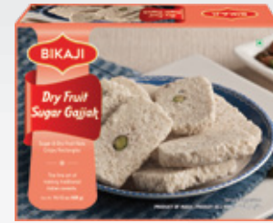
DRY FRUIT SUGAR GAJJAK