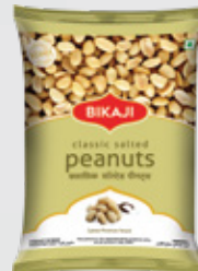
CLASSIC SALTED PEANUTS