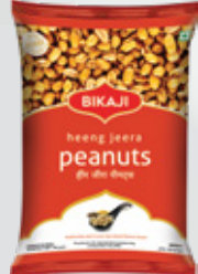
HEENG JEERA PEANUTS