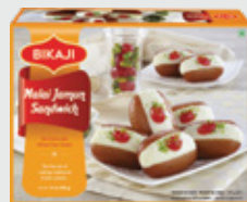
MALAI JAMUN SANDWICH