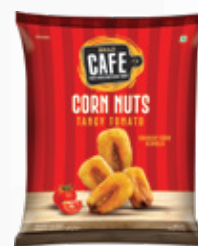
CORN NUTS TANGY TOMATO