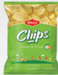
CREAM & ONION