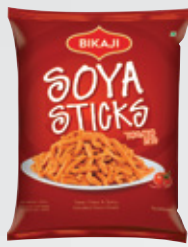
SOYA STICKS TOMATO BITE