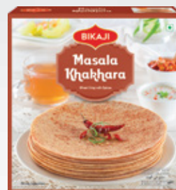
MASALA KHA KHARA