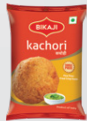
KACHORI (Single Piece)