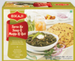
SARSO KA SAAG & MAKKE KI ROTI