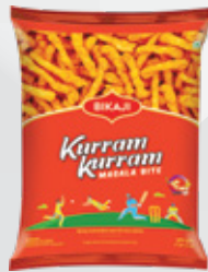
KURRAM KURRAM MASALA BITE