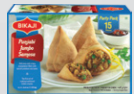
PUNJABI JUMBO SAMOSA