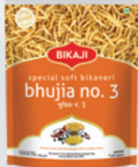
SPECIAL SOFT BIKANERI BHUJIA NO.3