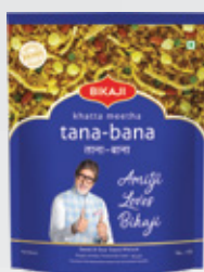
TANA-BANA KHATTA MEETHA