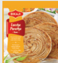
LACCHA PARATHA TAWA