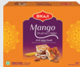
MANGO DRY FRUIT CHIKKI