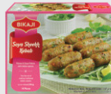
SOYA SHEEKH KEBAB