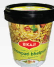
CHOWPATI BHELPURI (Mobile Bhelpuri Can)