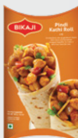
PINDI KATHI ROLL