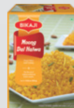
MOONG DAL HALWA