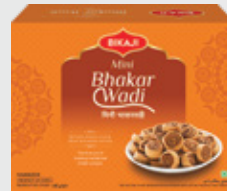
MINI BHAKAR WADI