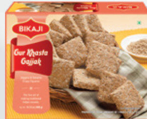
GUR KHASTA GAJJAK