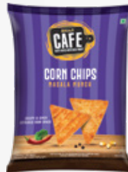
CORN CHIPS MASALA MUNCH