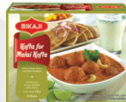
KOFTA FOR MALAI KOFTA