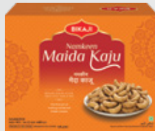
NAMKEEN MAIDA KAJU