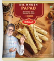
DIL KHUSH PAPAD