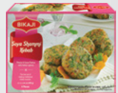
SOYA SHAMMI KEBAB