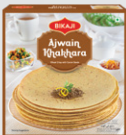
AJWAIN KHA KHARA