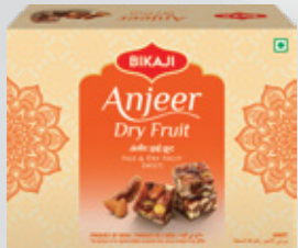
ANJEER DRY FRUIT BARFI