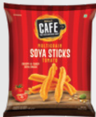
MULTIGRAIN SOYA STICKS TOMATO