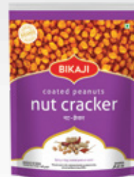
NUT CRACKER COATED PEANUTS