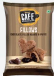
FILLOWS CHOCOLATE FILLED HEARTS & PUFFS