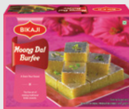
MOONG DAL BURFEE