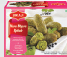
HARA BHARA KEBAB