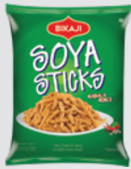
SOYA STICKS MASALA MUNCH