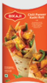
CHILI PANEER KATHI ROLL