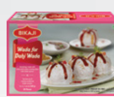
WADA FOR DAHI WADA