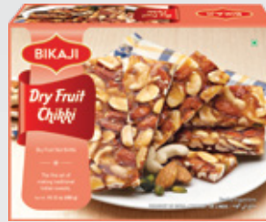
DRY FRUIT CHIKKI