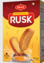
PREMIUM SUJI RUSK