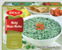
METHI MALAI MUTTER