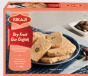
DRY FRUIT GUR GAJJAK