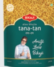
TANA-TAN ALOO BHUJIA