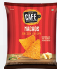
NACHOS CHEESY CRISPY