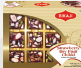
STRAWBERRY DRY FRUIT CHIKKI