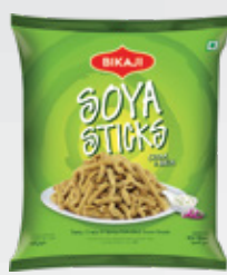
SOYA STICKS CREAM & ONION