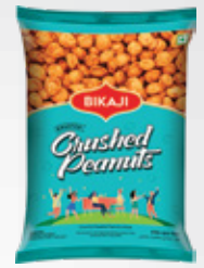
ROASTED CRUSHED PEANUTS