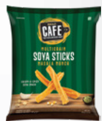
MULTIGRAIN SOYA STICKS MASALA MUNCH