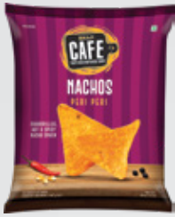
NACHOS PERI PERI