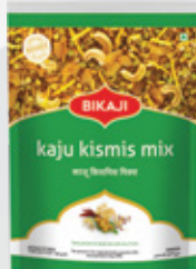
KAJU KISMIS MIX