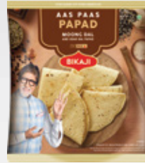
AAS PAAS PAPAD