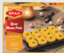
KESAR MAWA PEDA