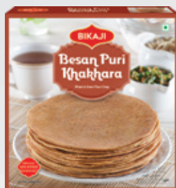
BESAN PURI KHA KHARA