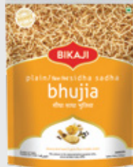
SIDHA SADHA BHUJIA