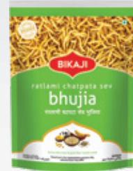
RATLAMI CHATPATA SEV BHUJIA