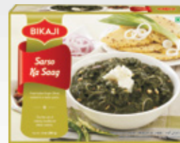
SARSO KA SAAG