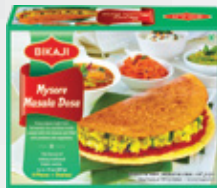
MYSORE MASALA DOSA