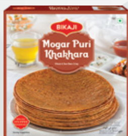
MOGAR PURI KHA KHARA