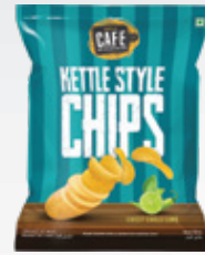
KETTLE STYLE CHIPS SWEET CHILLI LIME