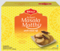
ACHARI MASALA MATTHI