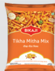
TIKHA MITHA MIX