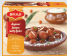
ANGOORI JAMUN WITH RABRI