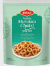
NASHTA MURUKKU CHAKRI