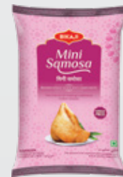
MINI SAMOSA (Single Piece)