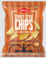
STREET STYLE CHIPS DAL KACHORI