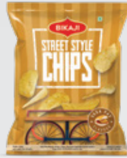
STREET STYLE CHIPS VADA PAV