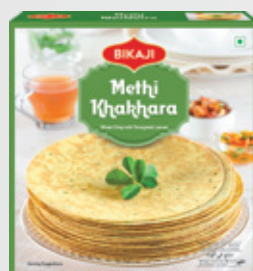
METHI KHA KHARA