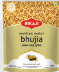
MAKHAN MALAI BHUJIA