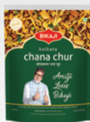
KOLKATA CHANA CHUR