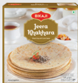
JEERA KHA KHARA