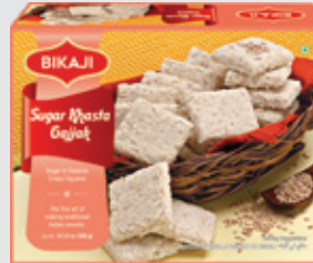
SUGAR KHASTA GAJJAK