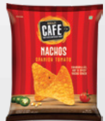
NACHOS SPANISH TOMATO