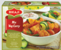
MIX VEG CURRY