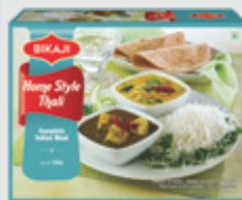
HOME STYLE THALI