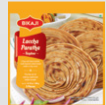
LACCHA PARATHA TANDOOR