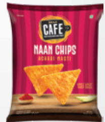
NAAN CHIPS ACHARI MASTI